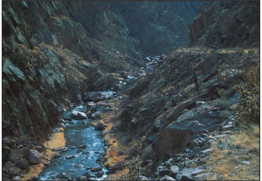
Grape Creek is a major perennial stream that drains the majority of the Wet Mountain Valley in south-central Colorado.

Grape Creek is a major perennial stream that drains the majority of the Wet Mountain Valley in southcentral Colorado. Water flow through the area is controlled upstream by DeWeese Reservoir. The Colorado Division of Wildlife and BLM are working with the irrigation company to provide managed flows that will enhance Grape Creek's fishery. The reservoir company has agreed to allow CDOW a 500 acrefoot minimum pool in the reservoir for fishery and recreation purposes,