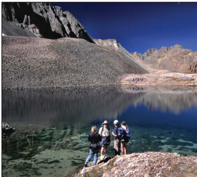
Sloan Lake, American Basin. (Mark Peason)

The watershed protected by the proposed wilderness includes portions of the recharge area for groundwater which Lake City taps for its domestic supply. Wilderness designation will serve to enhance the quality of this water source by preventing the sort of toxic contamination from mining activities which is prevalent in surrounding areas. The extensive tundra of the area also soaks up water and provides a major contribution to the Rio Grande watershed, a primary resource for agriculture in the San Luis Valley.