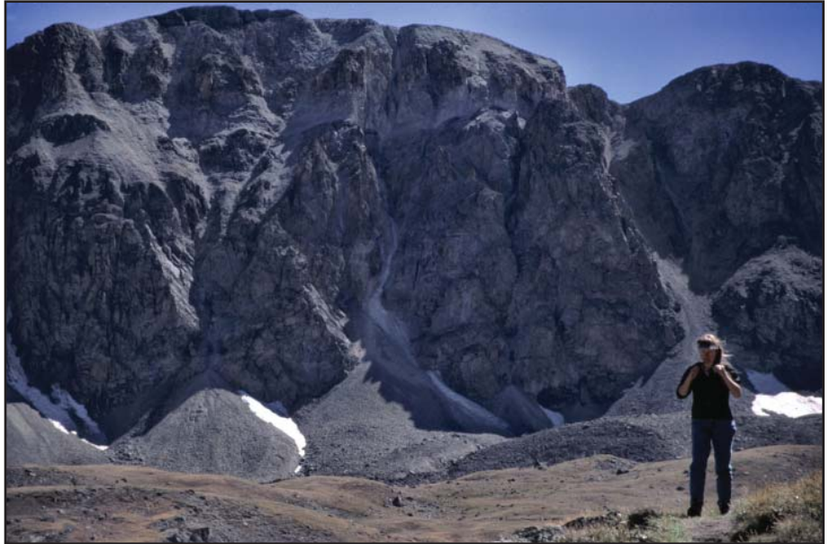
Hiker in the tundra. (Mark Pearson)

Grazing is authorized over much of the area. Parts of Pole Creek Mountain are closed to domestic livestock for protection of the herd of bighorn sheep. No range