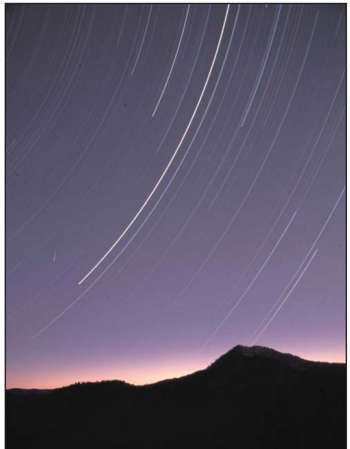
Perseid meteors over Corcoran Peak. (Jeff Widen)

South Shale Ridge provides critical winter range for deer and elk.