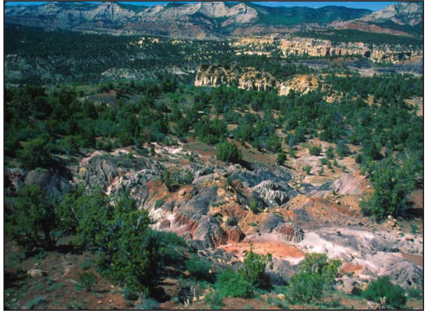
Exposed, multi-colored sandstone cliff faces. (Jeff Widen)