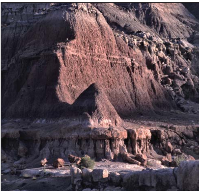
Hoodos in "Goblin Valley". (Jeff Widen)

The area is well defined by existing roads. The Spear Hunter Access Road defines the northern boundary of the unit. The boundaries of the CWP area are those identified by the Bureau of Land Management during its 1999 reinventory of South Shale Ridge roadless area.